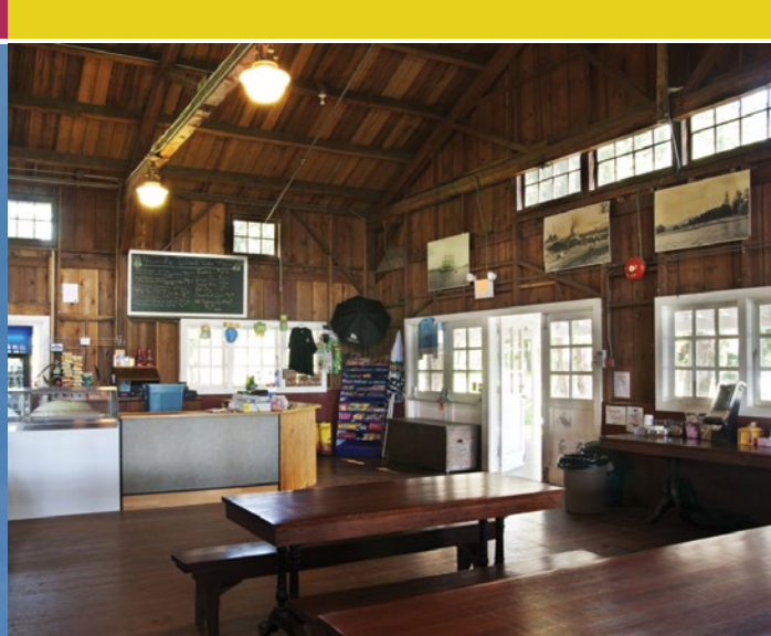
"A beautiful location..."