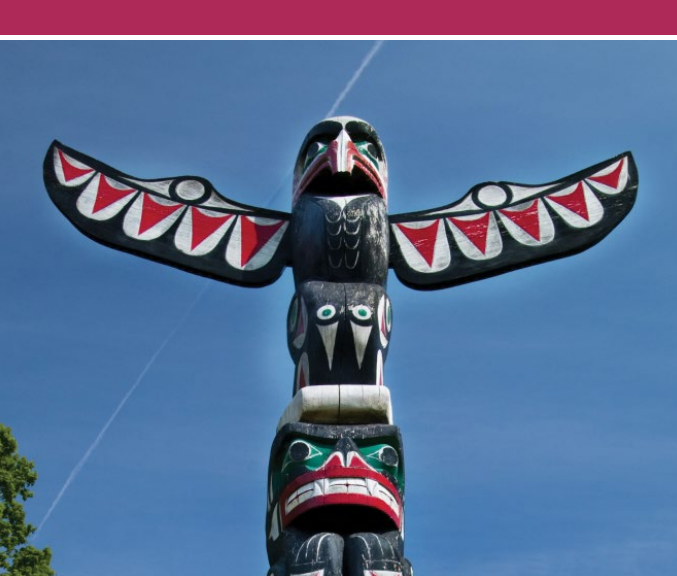
"I love this spot"