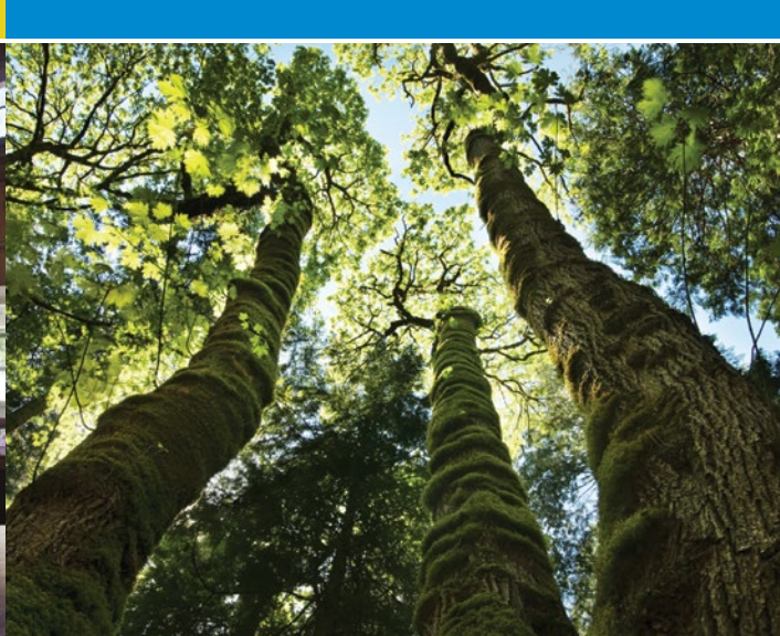
"A magical island"